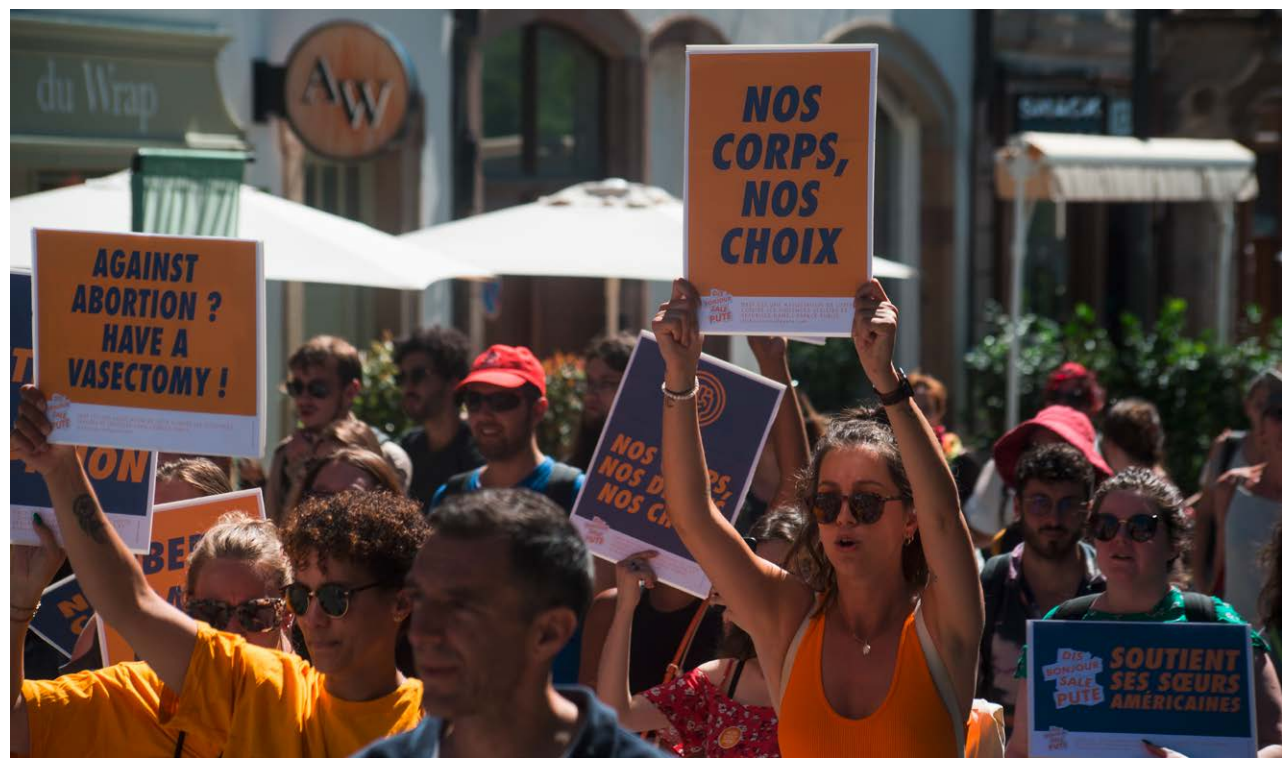
"Our body, our choice", 2 July 2022 in Strasbourg / France