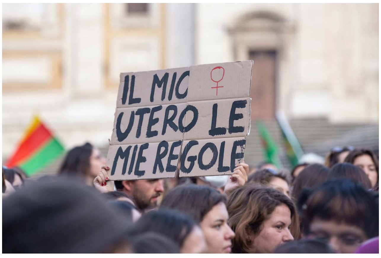
"My uterus, my rules", 28 September 2022 in Rome / Italy

Based on the aforementioned human rights, access to abortion is part of sexual and reproductive health and rights . These have been enshrined in international human rights since the United Nations World Population Conference in 1994. They relate to the realisation of a state of physical, mental, and social well-being in relation to all areas of human sexuality and reproduction.<sup>39</sup>