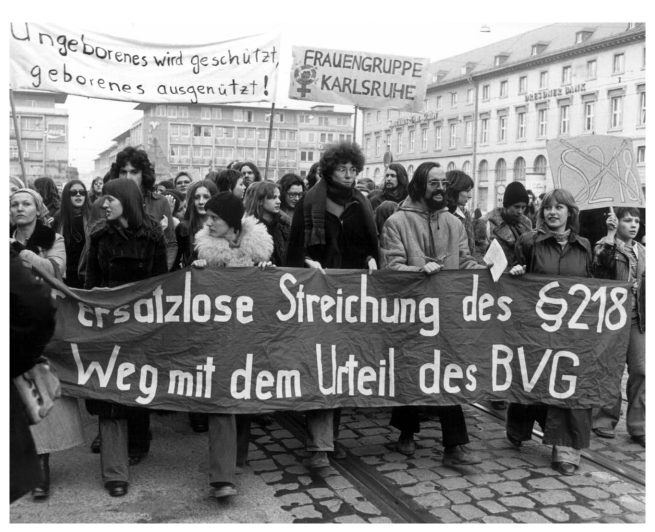
"Cancel § 218; Away with the Federal Constitutional Court's decision", 25 February 1975 in Karlsruhe / Germany

Since March 2023, a commission is to examine, among other issues, whether and how abortions could be regulated outside the criminal code. Its report is expected to be published in 2024.<sup>5</sup>