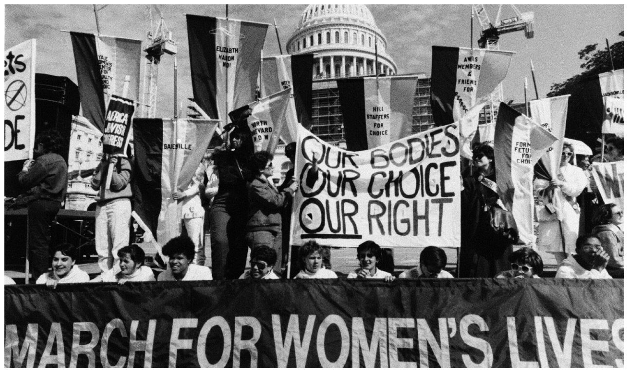
"Our bodies, our choice, our right", 10 March 1986 in Washington / USA

At the same time, there is a push to restrict access to abortion drugs throughout the US. A final ruling regarding the mifepristone litigation is expected in 2024.<sup>26</sup>