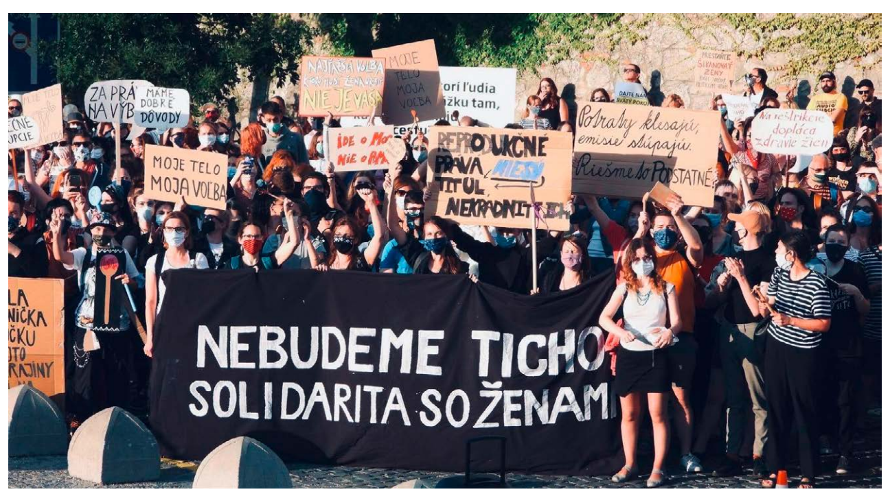
"My body, my rights", 7 July 2020 in Bratislava / Slovakia

The European Abortion Atlas ranks Slovakia among the worst countries in accessible and quality abortion care – 43rd out of 52. Freedom of Choice's own research confirms that abortion is hardly accessible and is rather a hurdle-race with many obstacles. These make it in some regions of the country and for many women in need impossible to access the procedure in time (12 weeks).