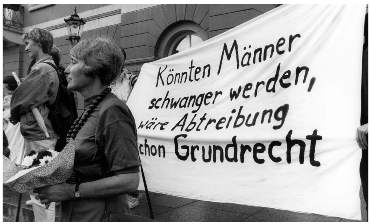
"If men could get pregnant, abortion would already be a basic right", 28 May 1993 in Karlsruhe / Germany