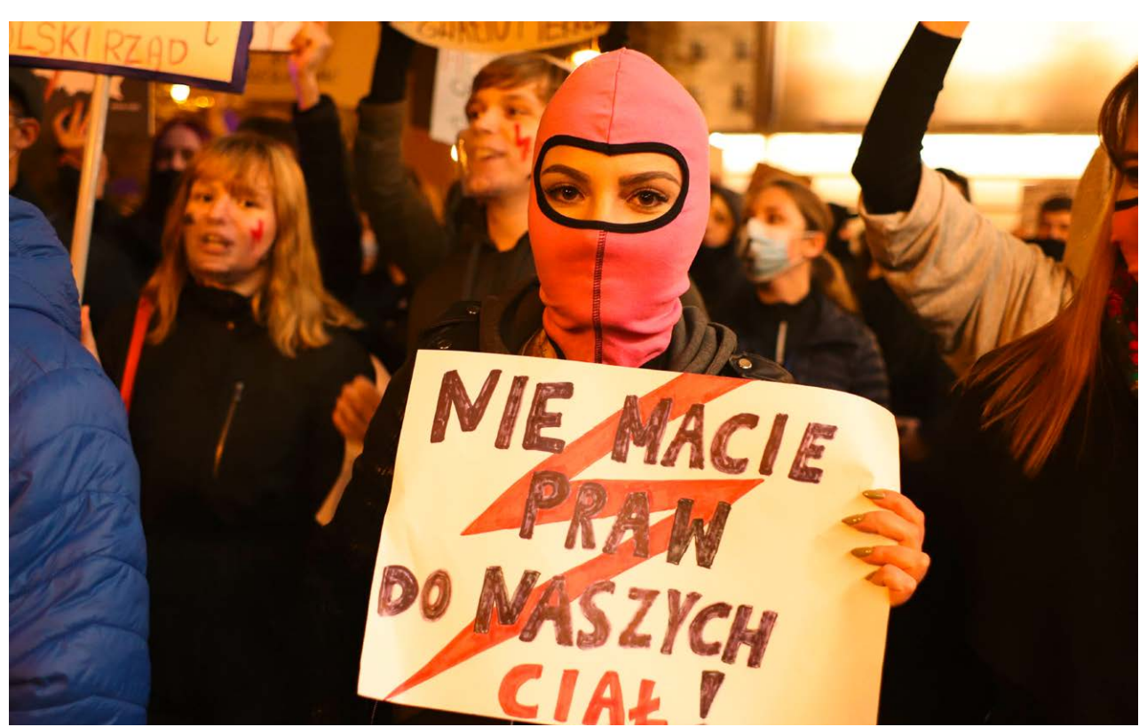
"You have no right to our bodies", 25 October 2020 in Katowice / Poland

Very often do political parties give their MPs a free vote based on their "conscience" when it comes to the so called "cultural-ethical" proposals which target human rights like abortion access, LGBTQ* rights, etc. This approach has led to a shift from the traditional division on anti-abortion bills between Christians and traditional-ists vs. progressives and liberals. There has been a worrying support (or at least lack of refusal) of such bills among some social democrats, who either vote for the proposals or choose to abstain.