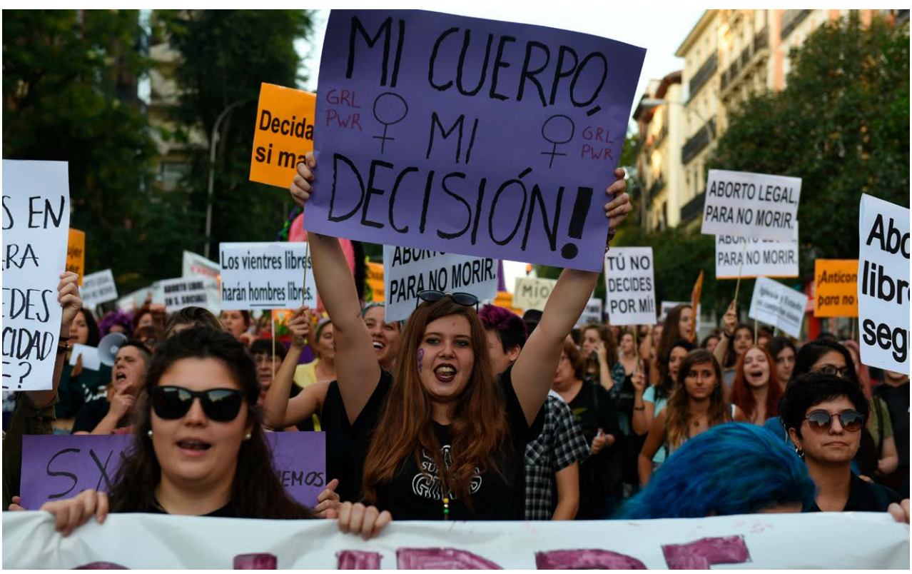
"My body, my decision", 28 September 2017 in Madrid / Spain

A look at the European picture shows very different situations in the individual countries as far as legal access to abortion is concerned. However, legalisation is rarely synonymous with quality care and good accessibility of safe abortion for all. This is partly due to the fact that social stigma continues to play a strong role. 6 In addition, there are regions within the European Union where further local or regional restrictions make it virtually impossible to access the right to an abortion, for instance in parts of Italy or Spain. <sup>7</sup> This is also linked to successful activities by opponents of abortion who are organised in transnationally active → anti-gender and → anti-abortion movements that campaign worldwide for a ban on abortion. However, these are in turn opposed by a large number of organisations and broad alliances of activists who campaign for the right to abortion throughout Europe.